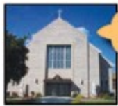
St. Francis Church 303 Clark Street